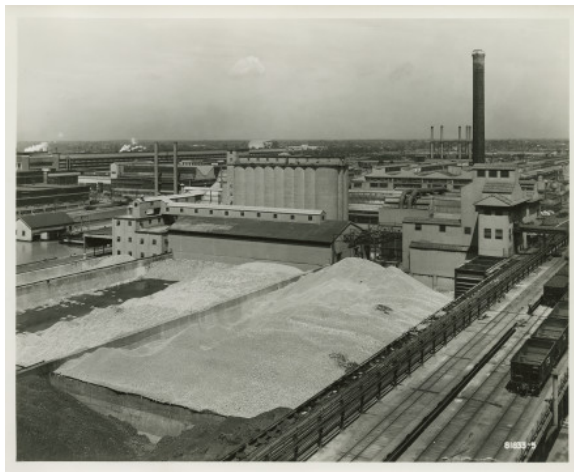
fig. 7 Charles Sheeler, Ford Rouge Cement Plant , 1945, photograph, Collections of The Henry Ford, copy and restrictions apply