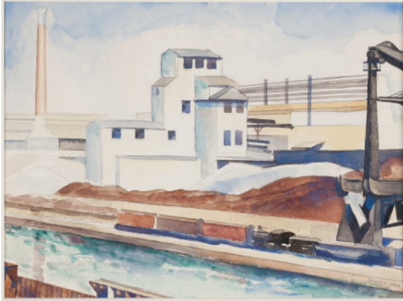
fig. 1 Charles Sheeler, River Rouge Industrial Plant , 1928, graphite and watercolor, Carnegie Museum of Art, Pittsburgh, Gift of G. David Thompson. © 2016 Carnegie Museum of Art, Pittsburgh