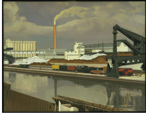
fig. 4 Charles Sheeler, American Landscape , 1930, oil on canvas, The Museum of Modern Art, New York, Gift of Abby Aldrich Rockefeller.