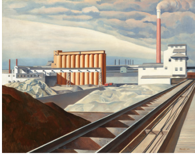
Charles Sheeler American, 1883 - 1965