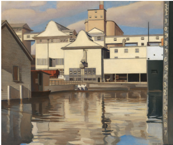
fig. 5 Charles Sheeler, River Rouge Plant , 1932, oil and pencil on canvas, Whitney Museum of American Art, New York, Purchase 32.43