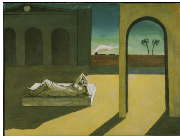
fig. 8 Giorgio de Chirico, The Soothsayer's Recompense , 1913, oil on canvas, Philadelphia Museum of Art, The Louise and Walter Arensberg Collection. © 2016 Artists Rights Society (ARS), New York / SIAE, Rome