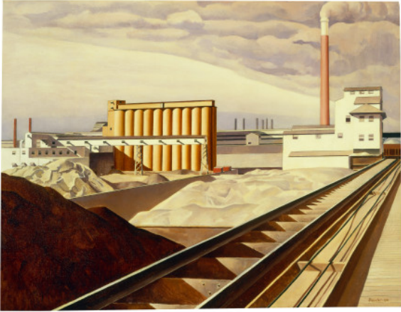
fig. 3 Charles Sheeler, Classic Landscape , 1928, watercolor, gouache, and graphite, National Gallery of Art, Washington, Collection of Barney A. Ebsworth