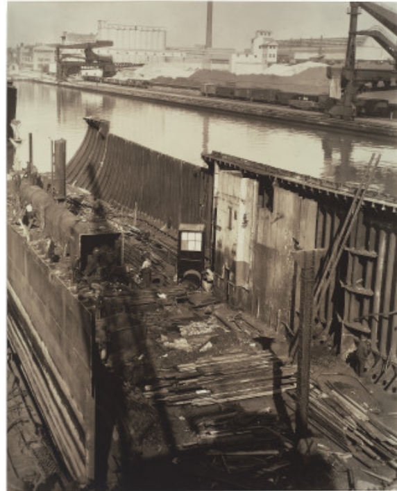
fig. 2 Charles Sheeler, Salvage Ship-Ford Plant , 1927, gelatin silver print, Museum of Fine Arts, Boston.