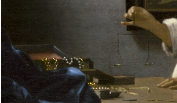
fig. 1 Detail, Johannes Vermeer, Woman Holding a Balance , c. 1664, oil on canvas, National Gallery of Art, Washington, Widener Collection, 1942.9.97