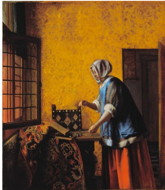
fig. 4 Pieter de Hooch, A Woman Weighing Gold , mid-1660s, oil on canvas, Staatliche Museen zu Berlin, Preussischer Kulturbesitz, Gemäldegalerie.