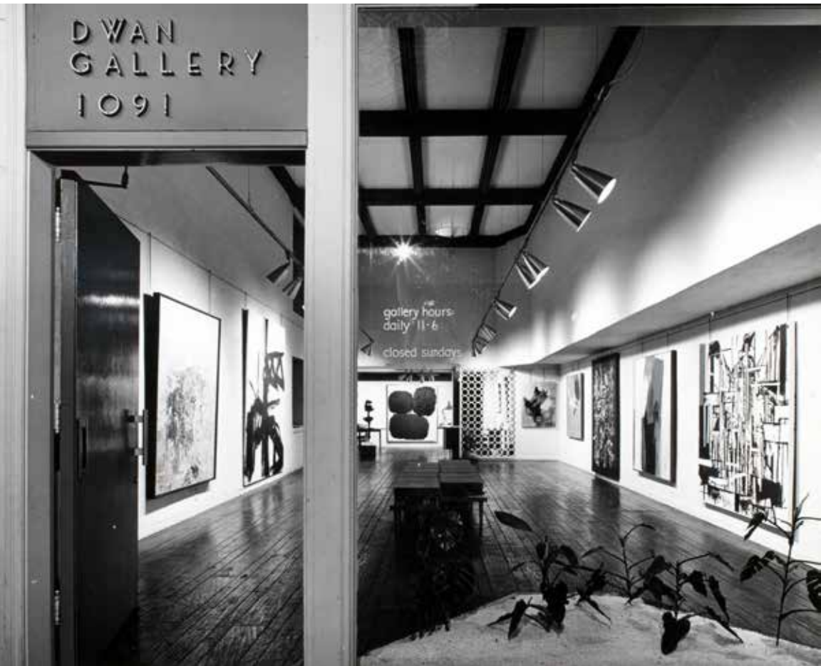
Installation view of 15 of New York , Los Angeles, October - November 1960