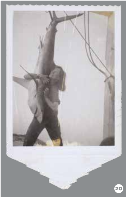
19 Niki de Saint Phalle with Heart No. 1 , Los Angeles, 1963, photo by Virginia Dwan (?), DGA