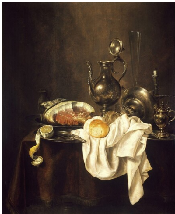
fig. 1 Gerret Willemsz Heda, Still Life with Ham , 1649, oil on panel, Pushkin Museum, Moscow.