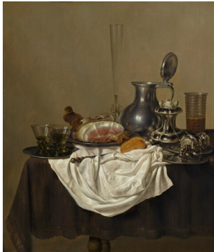
Gerret Willemsz Heda Dutch, active 1640s and 1650s