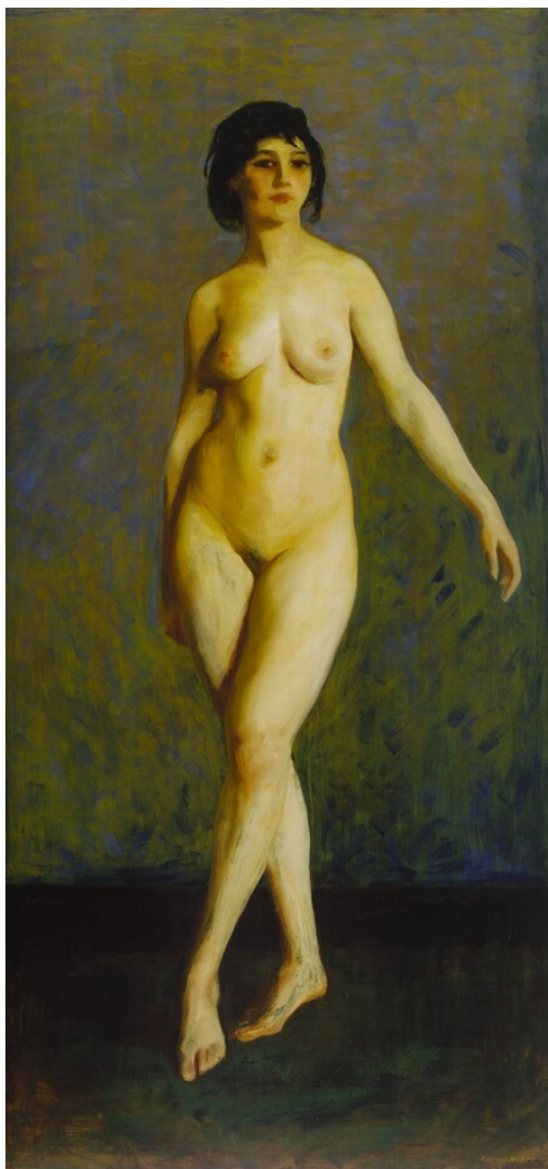
fig. 3 Robert Henri, Figure in Motion , 1913, oil on canvas, Terra Foundation for American Art, Chicago, Daniel J. Terra Collection, 1999.69