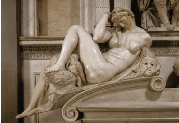
fig. 1 Michelangelo, Night , detail from the tomb of Giuliano de' Medici, 1519–1534, marble, Medici Chapel, Basilica of San Lorenzo, Florence.