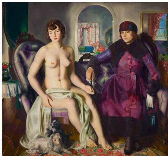
fig. 4 George Bellows, Two Women , 1924, oil on canvas, Crystal Bridges Museum of American Art, Bentonville, Arkansas, 2014.25. Photography by Edward C. Robison III