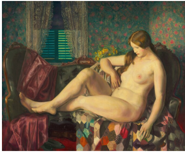
George Bellows American, 1882 - 1925