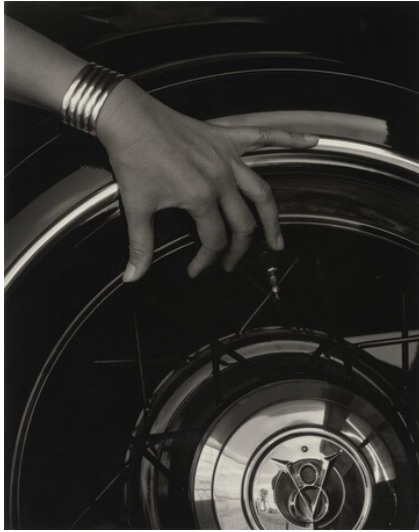
Alfred Stieglitz Georgia O'Keeffe—Hand and Wheel 1933 gelatin silver print Key Set Number 1519