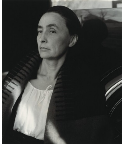
Alfred Stieglitz Georgia O'Keeffe 1933 gelatin silver print Key Set Number 1520