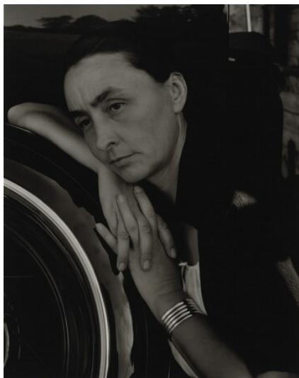
Alfred Stieglitz Georgia O'Keeffe 1933 gelatin silver print Key Set Number 1516