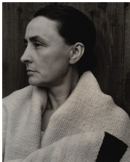
Alfred Stieglitz Georgia O'Keeffe 1931 gelatin silver print Key Set Number 1434