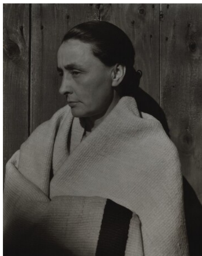
Alfred Stieglitz Georgia O'Keeffe 1931 gelatin silver print Key Set Number 1435