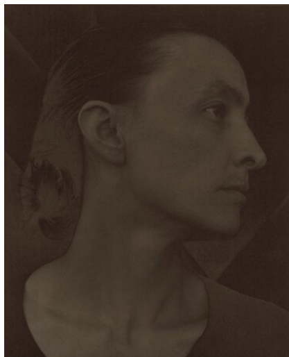
Alfred Stieglitz Georgia O'Keeffe 1921 palladium print Key Set Number 673