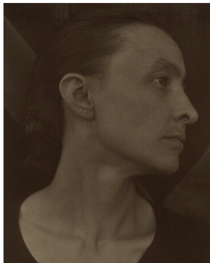
Alfred Stieglitz Georgia O'Keeffe 1921 palladium print Key Set Number 672