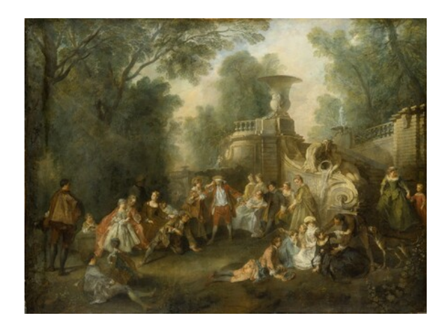
fig. 7 Nicolas Lancret, Blindman's Buff , before 1738, oil on canvas, Stiftung Preußische Schlösser und Gärten Berlin-Brandenburg.

French Paintings of the Fifteenth through Eighteenth Centuries