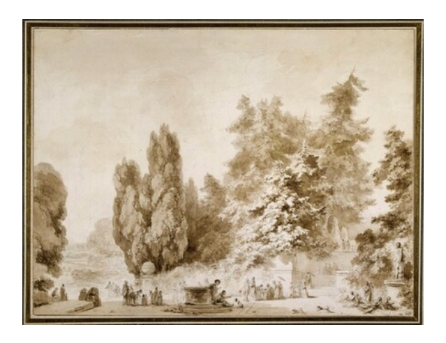
fig. 3 Jean-Honoré Fragonard, A Garden Near Rome, c. 1773–1774, ink wash over black chalk, Musée du Petit Palais, Paris, France.

French Paintings of the Fifteenth through Eighteenth Centuries