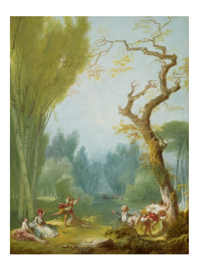
fig. 5 Jean Honoré Fragonard, A Game of Horse and Rider, c. 1775/1780, oil on canvas, National Gallery of Art, Washington, Samuel H. Kress Collection, 1946.7.5