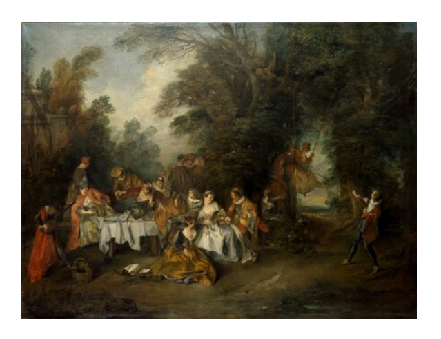
fig. 8 Nicolas Lancret, The Italian Meal , before 1738, oil on canvas, Stiftung Preußische Schlösser und Gärten Berlin-Brandenburg.