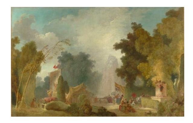
fig. 4 Jean-Honoré Fragonard, Fête at Saint-Cloud, c. 1775–1780, oil on canvas, Banque de France, Paris, France.