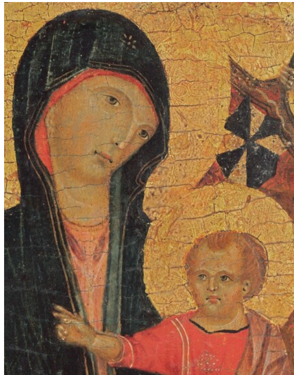
fig. 2 Detail of Madonna, Tuscan thirteenth century, Madonna and Child with Saint John the Baptist, Saint Peter, and Two Angels , c. 1290, tempera on panel, National Gallery of Art, Washington, Samuel H. Kress Collection