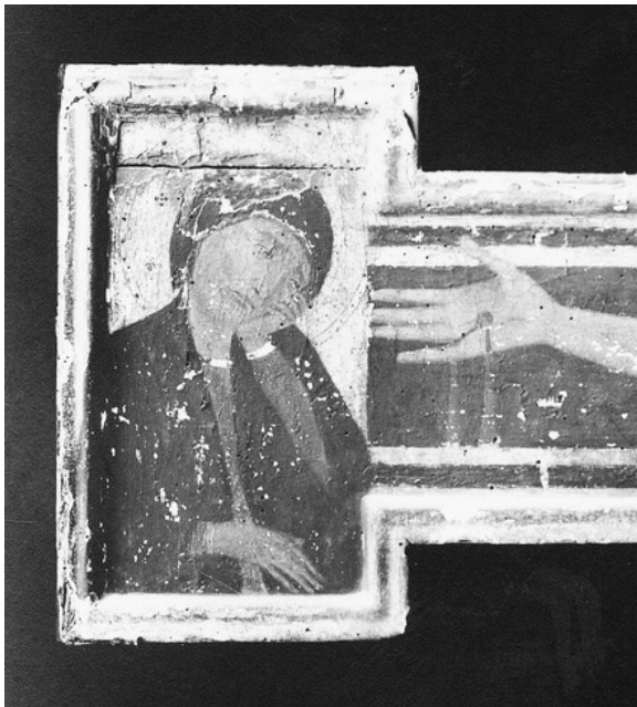
fig. 1 Detail of Mourning Madonna, Penultimate Master of the Baptistery, Painted Crucifix , 1280–1290, tempera on panel, Church of Santo Stefano a Paterno, Bagno a Ripoli, Florence. Edizioni Brogi photograph, National Gallery of Art, George Martin Richter Archive, vol. 3, folder 3, sheet 17