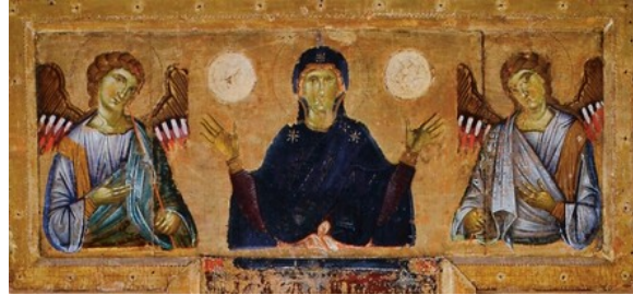
fig. 4 Detail of upper terminal, Master of the Franciscan Crucifixes, Painted Crucifix with the Madonna between Two Angels , c. 1270/1275, tempera on panel, Pinacoteca Nazionale di Bologna