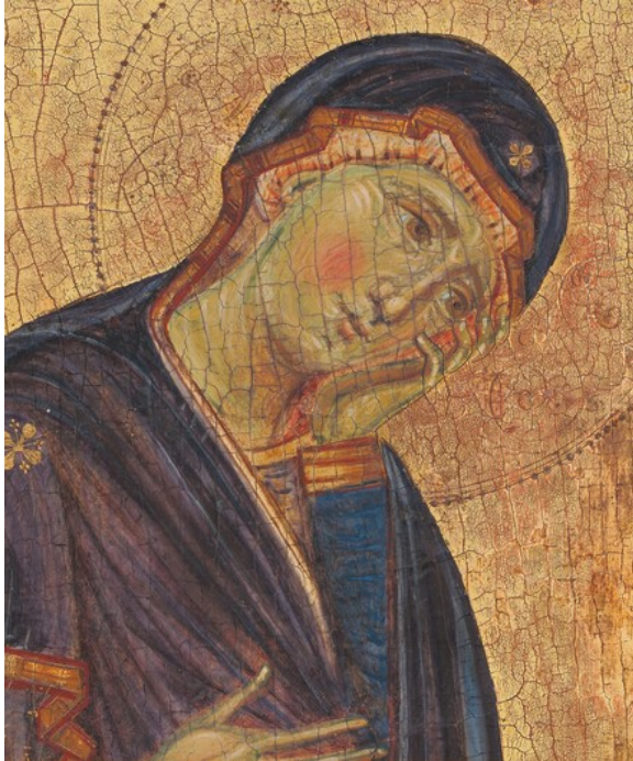
fig. 5 Detail, Master of the Franciscan Crucifixes, The Mourning Madonna , 1270/1275, tempera on panel, National Gallery of Art, Washington, Samuel H. Kress Collection