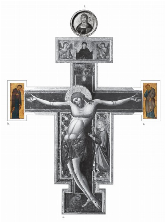
fig. 1 Reconstruction of a painted crucifix, formerly in San Francesco, Bologna, by the Master of the Franciscan Crucifixes (color images are NGA objects): a. Painted Crucifix with the Madonna between Two Angels (above) and the Kneeling Saint Francis (below), and Saint Helen (added by Jacopo di Paolo) (fig. 3); b. The Mourning Madonna ; c. The Mourning Saint John the Evangelist ; d. Bust of the Blessing Christ (fig. 2)