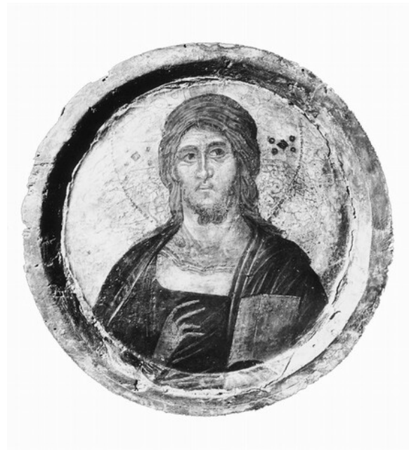
fig. 2 Master of the Franciscan Crucifixes, Bust of the Blessing Christ , c. 1270/1275, tempera on panel, now lost