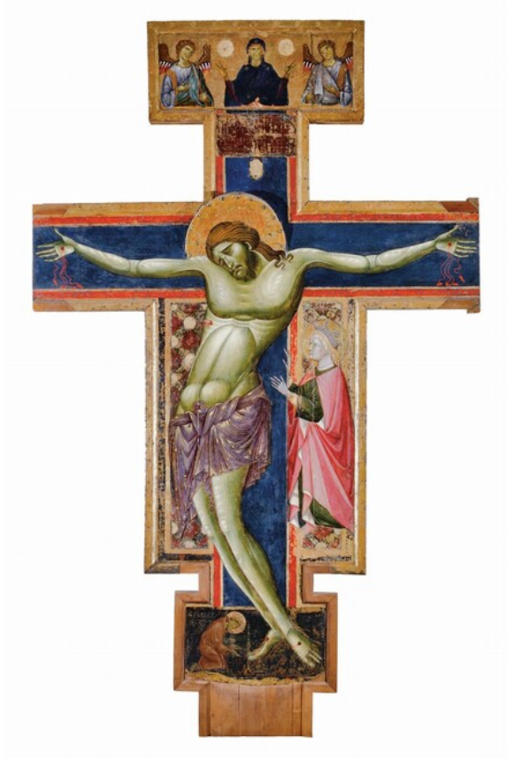
fig. 3 Master of the Franciscan Crucifixes, Painted Crucifix with the Madonna between Two Angels (above) and the Kneeling Saint Francis (below), and Saint Helen (added by Jacopo di Paolo), c. 1270/1275, tempera on panel, Pinacoteca Nazionale di Bologna