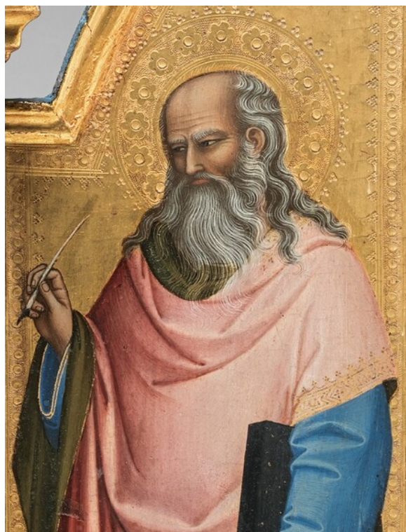
fig. 3 Detail of Saint John, Nardo di Cione, Madonna and Child, with Saints Peter and John the Evangelist, and Man of Sorrows , c. 1360, tempera on panel, National Gallery of Art, Washington, Samuel H. Kress Collection