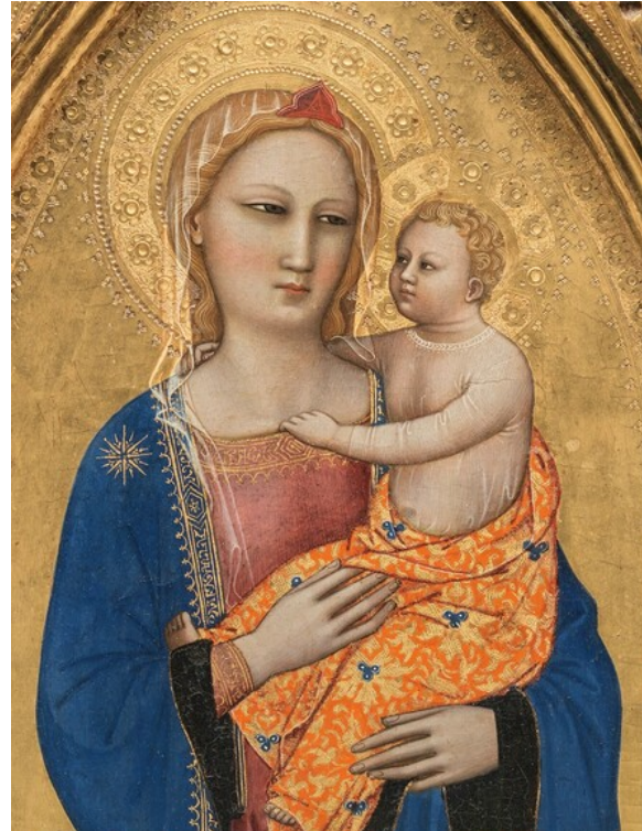
fig. 2 Detail of Mary, Nardo di Cione, Madonna and Child, with Saints Peter and John the Evangelist, and Man of Sorrows , c. 1360, tempera on panel, National Gallery of Art, Washington, Samuel H. Kress Collection