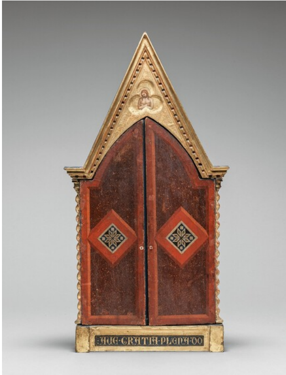
fig. 1 Exterior view of portable triptych with wings closed, tempera on panel, National Gallery of Art, Washington, Samuel H. Kress Collection