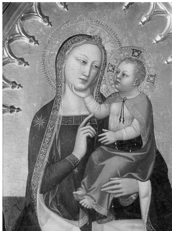
fig. 4 Nardo di Cione, Madonna and Child , tempera on panel, Bojnice Castle, Slovakia