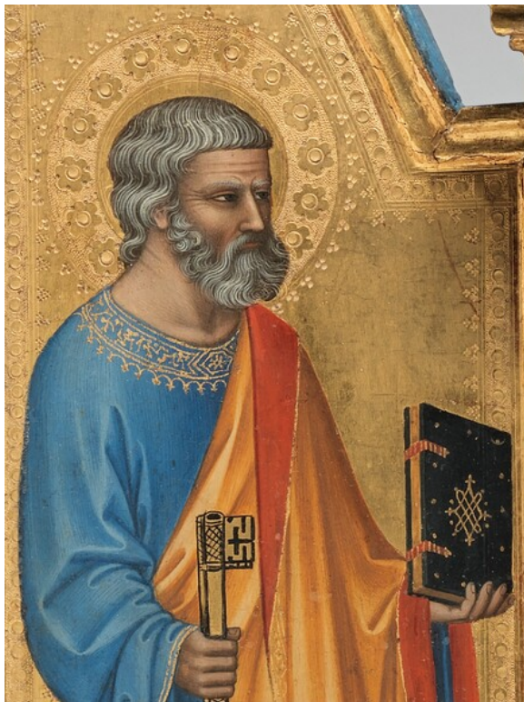
fig. 5 Detail of Saint Peter, Nardo di Cione, Madonna and Child, with Saints Peter and John the Evangelist, and Man of Sorrows , c. 1360, tempera on panel, National Gallery of Art, Washington, Samuel H. Kress Collection