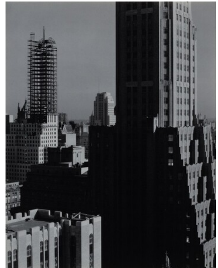
Alfred Stieglitz From My Window at the Shelton, North 1931 gelatin silver print Key Set Number 1387