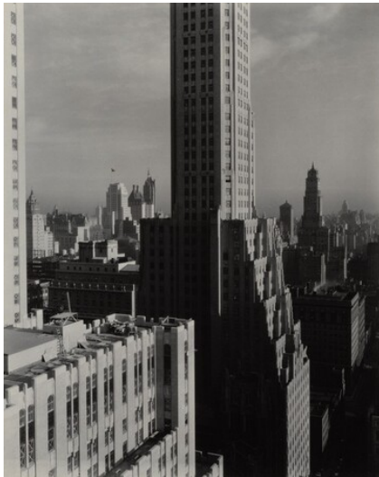
Alfred Stieglitz From My Window at the Shelton, North 1931 gelatin silver print Key Set Number 1385