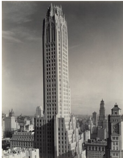
Alfred Stieglitz From My Window at the Shelton, North 1931 gelatin silver print Key Set Number 1386