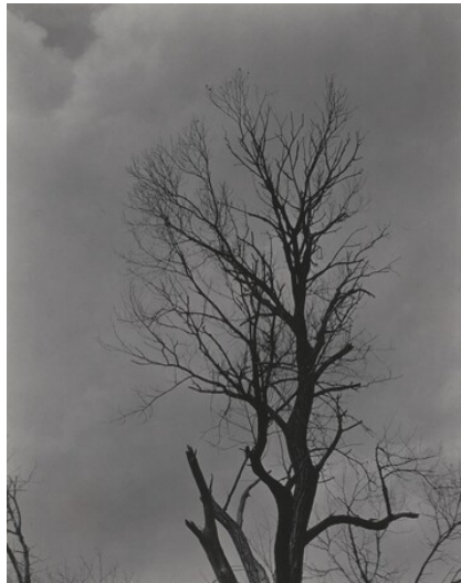
Alfred Stieglitz Tree Set 2 probably 1924 gelatin silver print Key Set Number 1047