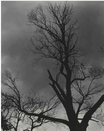
Alfred Stieglitz Tree Set 1 probably 1924 gelatin silver print Key Set Number 1046