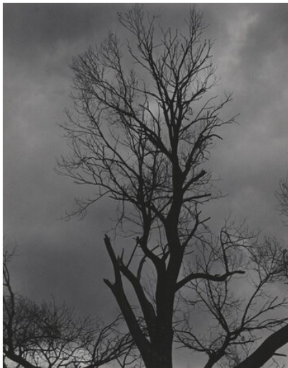
Alfred Stieglitz Tree Set 5 probably 1924 gelatin silver print Key Set Number 1050