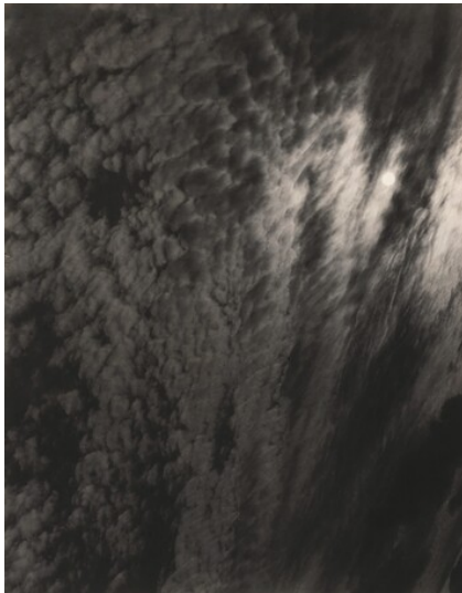
Alfred Stieglitz Equivalent, Series XX No. 2 1929 gelatin silver print Key Set Number 1285