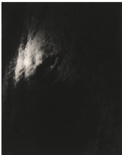
Alfred Stieglitz Equivalent, Series XX No. 8 1929 gelatin silver print Key Set Number 1291