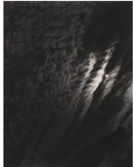
Alfred Stieglitz Equivalent, Series XX No. 4 1929 gelatin silver print Key Set Number 1287