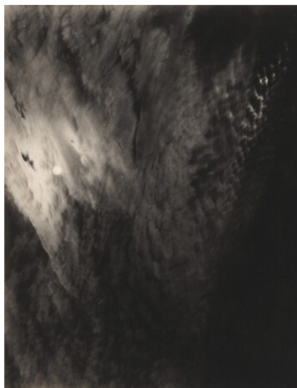
Alfred Stieglitz Equivalent, Series XX No. 9 1929 gelatin silver print Key Set Number 1292