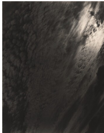
Alfred Stieglitz Equivalent, Series XX No. 7 1929 gelatin silver print Key Set Number 1290