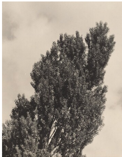
Alfred Stieglitz Equivalent probably 1927 gelatin silver print Key Set Number 1207