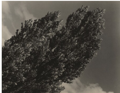
Alfred Stieglitz Equivalent 1927 gelatin silver print Key Set Number 1198