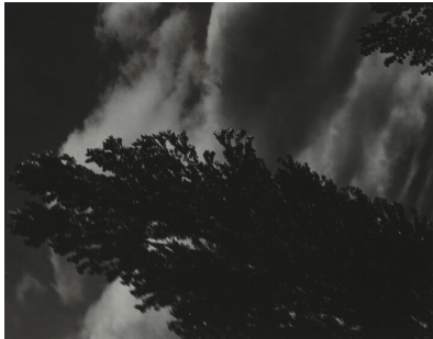
Alfred Stieglitz American, 1864 - 1946