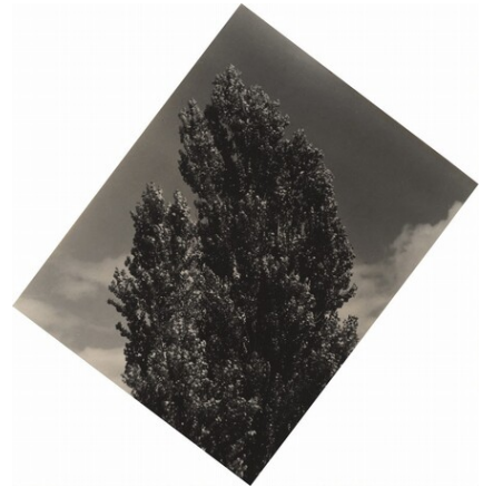
Alfred Stieglitz Equivalent 1927 gelatin silver print Key Set Number 1199