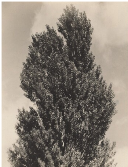
Alfred Stieglitz Equivalent probably 1927 gelatin silver print Key Set Number 1206