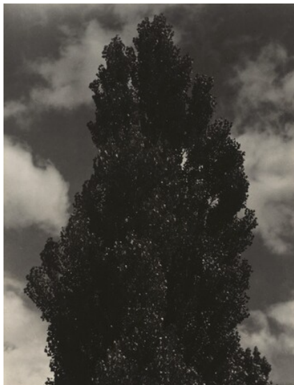
Alfred Stieglitz Equivalent 1927 gelatin silver print Key Set Number 1200