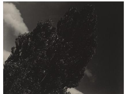
Alfred Stieglitz Equivalent 1927 gelatin silver print Key Set Number 1202