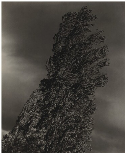
Alfred Stieglitz Equivalent probably 1927 gelatin silver print Key Set Number 1205