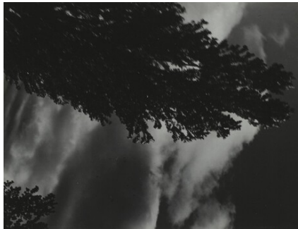
Alfred Stieglitz Equivalent probably 1927 gelatin silver print Key Set Number 1203 same negative