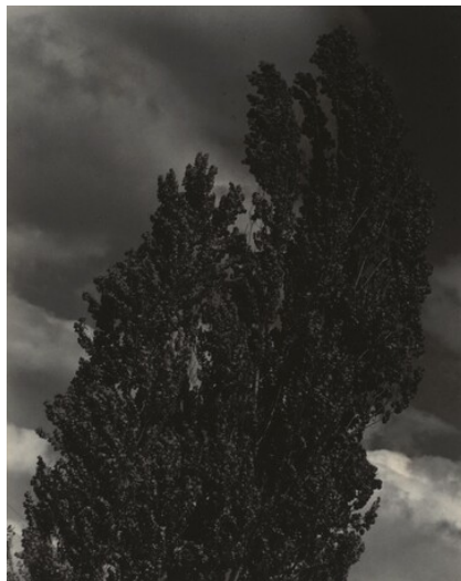
Alfred Stieglitz Equivalent 1927 gelatin silver print Key Set Number 1201