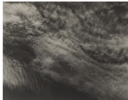
Alfred Stieglitz Equivalent 1925 gelatin silver print Key Set Number 1101