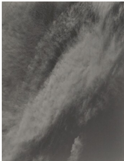
Alfred Stieglitz Equivalent 1925 gelatin silver print Key Set Number 1100