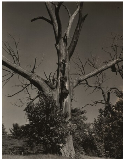
Alfred Stieglitz Dead Chestnut Tree probably 1937 gelatin silver print Key Set Number 1637