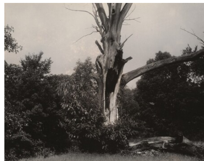
Alfred Stieglitz Dead Chestnut Tree probably 1937 gelatin silver print Key Set Number 1638