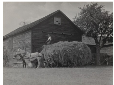
Alfred Stieglitz The Hay Wagon and Barn 1922 gelatin silver print Key Set Number 786