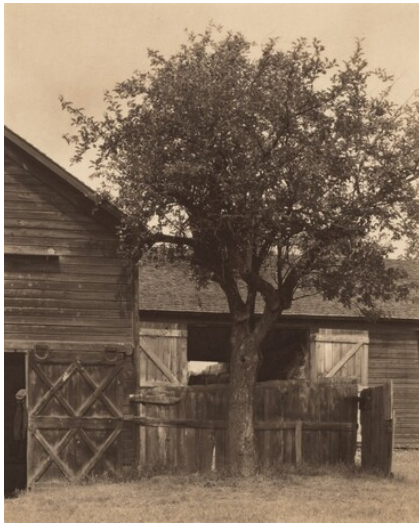
Alfred Stieglitz The Barn 1922 palladium print Key Set Number 781