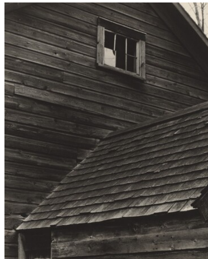
Alfred Stieglitz Barn—Lake George 1922 gelatin silver print Key Set Number 789