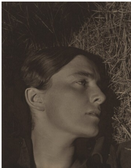
Alfred Stieglitz Rebecca Salsbury Strand 1922 palladium print Key Set Number 746 same negative