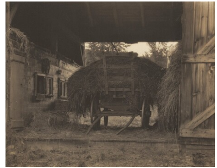
Alfred Stieglitz The Hay Wagon 1922 palladium print Key Set Number 782