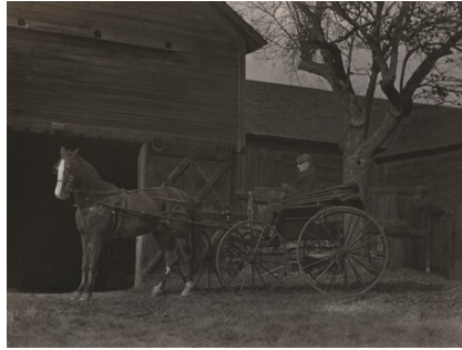
Alfred Stieglitz Horse and Carriage probably 1922 gelatin silver print Key Set Number 788