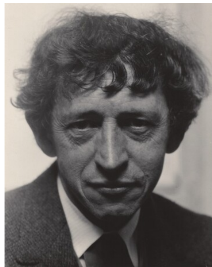
Alfred Stieglitz John Marin, the Water Colorist 1921/1922 gelatin silver print Key Set Number 709