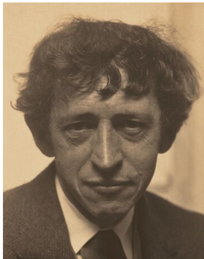
Alfred Stieglitz John Marin, the Water Colorist 1921/1922 palladium print Key Set Number 708