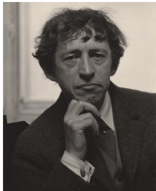
Alfred Stieglitz American, 1864 - 1946