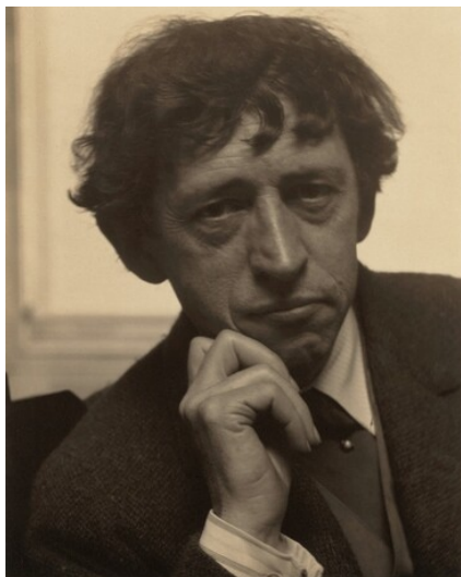
Alfred Stieglitz John Marin 1921/1922 palladium print Key Set Number 706