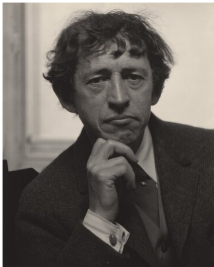
Alfred Stieglitz John Marin 1921/1922 gelatin silver print Key Set Number 707