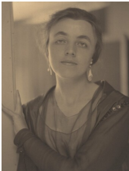
Alfred Stieglitz Katharine N. Rhoades 1915 platinum print Key Set Number 410 same negative