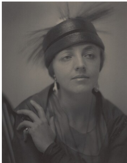
Alfred Stieglitz Katharine N. Rhoades 1915 platinum print Key Set Number 407