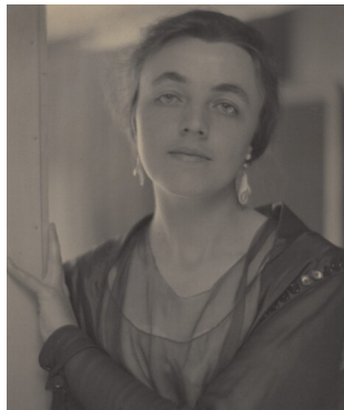
Alfred Stieglitz American, 1864 - 1946