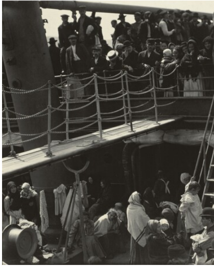
Alfred Stieglitz The Steerage 1907, printed 1929/1932 gelatin silver print Key Set Number 314 same negative