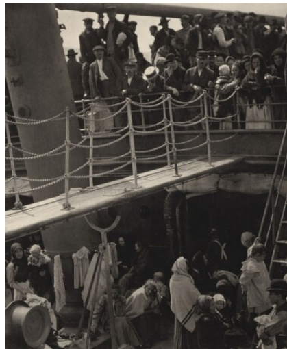
Alfred Stieglitz The Steerage 1907, printed in or before 1913 photogravure Key Set Number 312 same negative