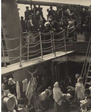
Alfred Stieglitz American, 1864 - 1946