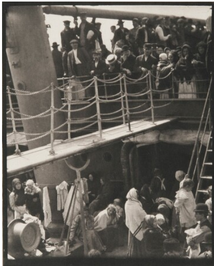
Alfred Stieglitz (editor/publisher) after Various Artists Alfred Stieglitz The Steerage 1907, printed 1911 photogravure Key Set Number 310 same negative