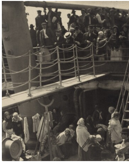
Alfred Stieglitz The Steerage 1907, printed 1911 photogravure Key Set Number 311 same negative