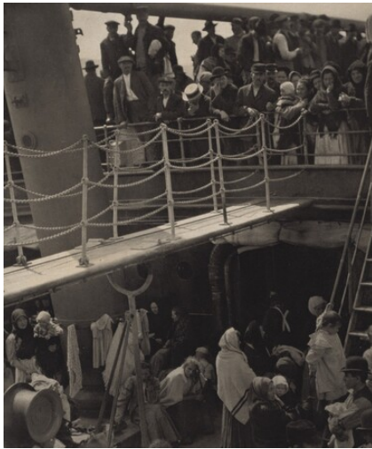
Alfred Stieglitz The Steerage 1907, printed 1915 photogravure Key Set Number 313 same negative