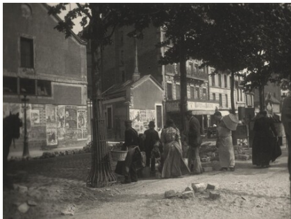
Alfred Stieglitz Paris 1894, printed 1929/1934 gelatin silver print Key Set Number 362