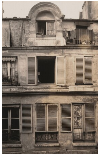
Alfred Stieglitz European Building 1894, printed 1929/1934 gelatin silver print Key Set Number 364