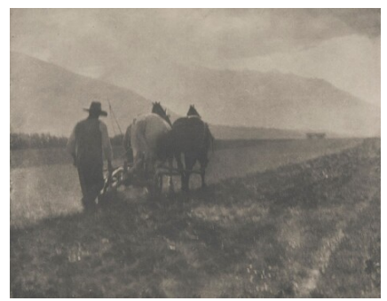
Alfred Stieglitz (editor/publisher) after Various Artists Alfred Stieglitz Ploughing 1904, printed 1905 photogravure Key Set Number 295