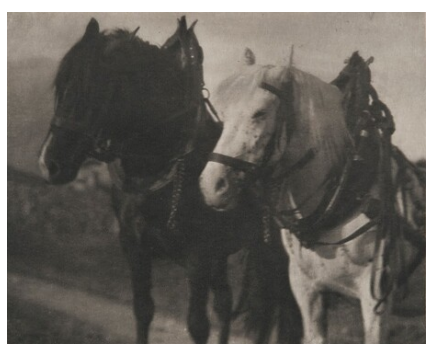
Alfred Stieglitz (editor/publisher) after Various Artists Alfred Stieglitz Horses 1904, printed 1905 photogravure Key Set Number 296 same negative