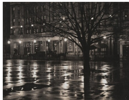
Alfred Stieglitz Night—New York 1897, printed 1929/1932 gelatin silver print Key Set Number 254