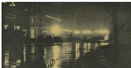
Alfred Stieglitz The Glow of Night—New York 1896, printed 1897 photogravure Key Set Number 251