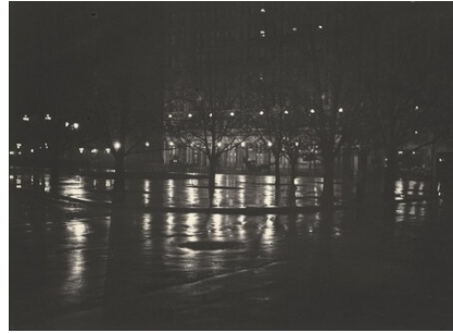
Alfred Stieglitz Night, New York 1897, printed 1929/1934 gelatin silver print Key Set Number 256