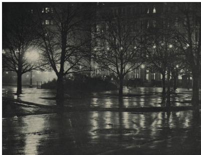
Alfred Stieglitz American, 1864 - 1946