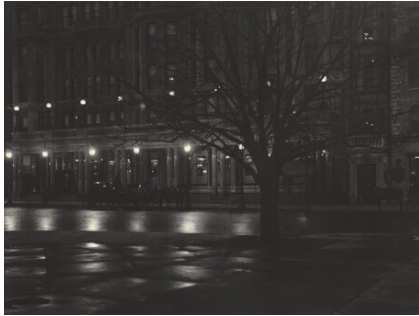
Alfred Stieglitz Night—The Savoy 1897, printed 1929/1932 gelatin silver print Key Set Number 255