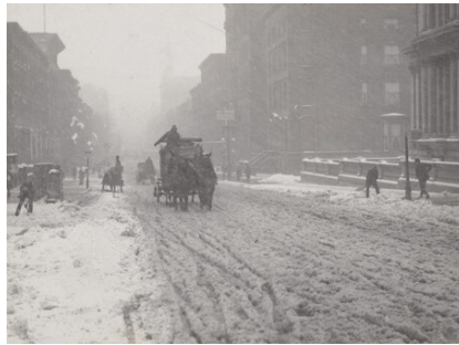
Alfred Stieglitz Winter on Fifth Avenue 1893, printed 1929/1932 gelatin silver print Key Set Number 86 same negative