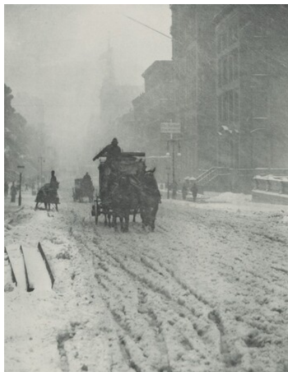
Alfred Stieglitz Winter, Fifth Avenue 1893, printed 1897 photogravure Key Set Number 83 same negative