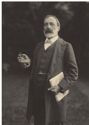
Alfred Stieglitz American, 1864 - 1946