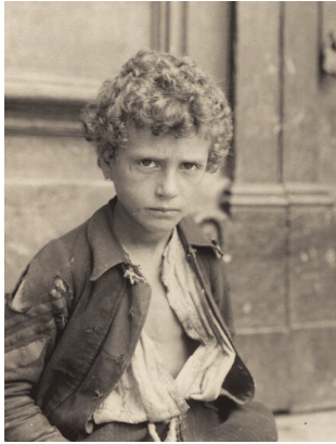
Alfred Stieglitz American, 1864 - 1946