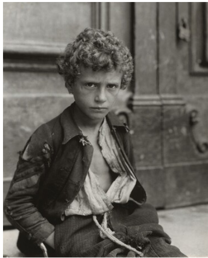
Alfred Stieglitz A Venetian Gamin 1894, printed 1929/1934 gelatin silver print Key Set Number 169 same negative