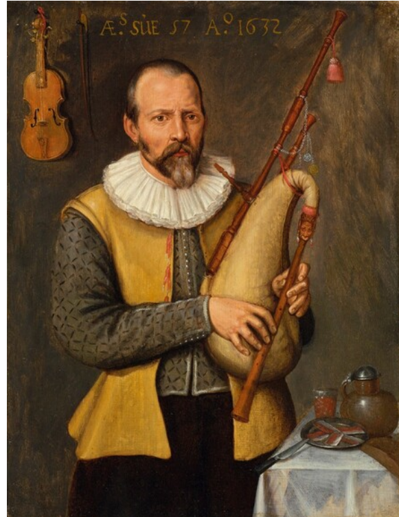
fig. 4 Anonymous, Musician Holding Bagpipes , 1632, oil on panel, Concordia University, Montreal