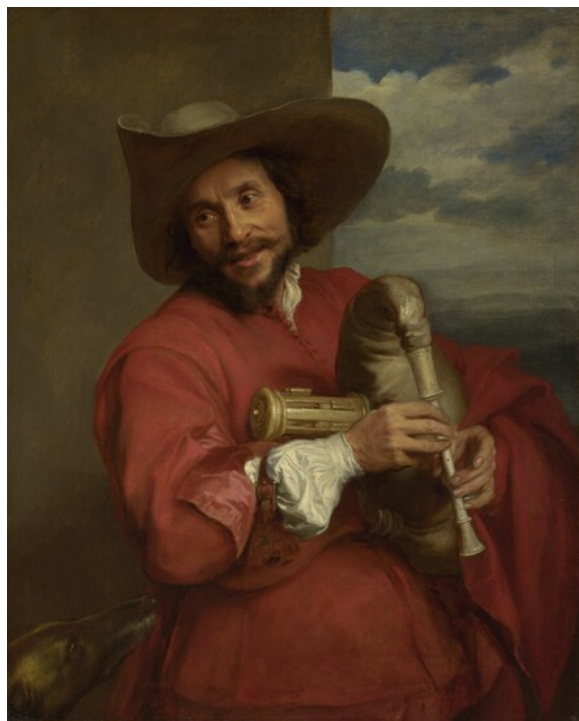
fig. 3 Anthony van Dyck, Portrait of François Langlois , probably early 1630s, oil on canvas, National Gallery, London, Bought jointly by the National Gallery and the Barber Institute of Fine Arts, University of Birmingham, with the assistance of the Heritage Lottery Fund, 1997.