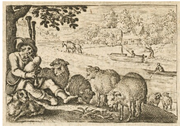
fig. 2 Anonymous, Cordion Playing a Bagpipe , engraving from Daniel Heinsius, "Pastorael," in Heinsius, Nederduytsche poemata , Amsterdam, 1616