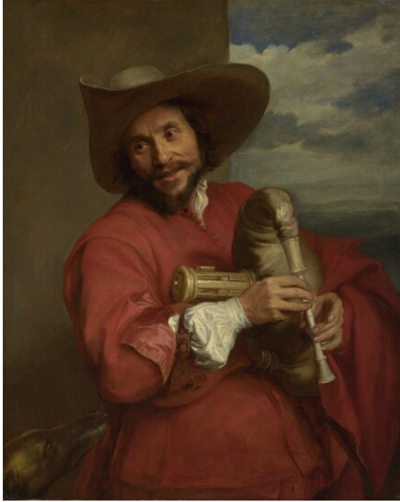
fig. 3 Anthony van Dyck, Portrait of François Langlois , probably early 1630s, oil on canvas, National Gallery, London, Bought jointly by the National Gallery and the Barber Institute of Fine Arts, University of Birmingham, with the assistance of the Heritage Lottery Fund, 1997.