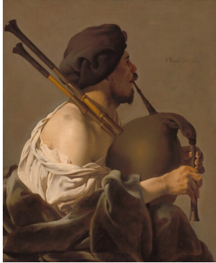
Hendrick ter Brugghen Dutch, 1588 - 1629