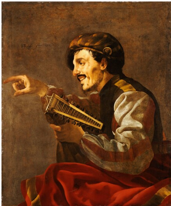
fig. 5 Hendrick ter Brugghen, Pointing Lute Player (A Seated Lutanist Pointing) , 1624, oil on canvas, private collection.