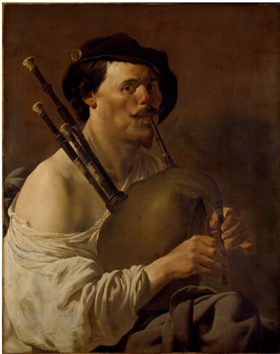
fig. 1 Hendrick ter Brugghen, Portrait of a Man Playing the Bagpipes , 1624, oil on canvas, Ashmolean Museum, Oxford