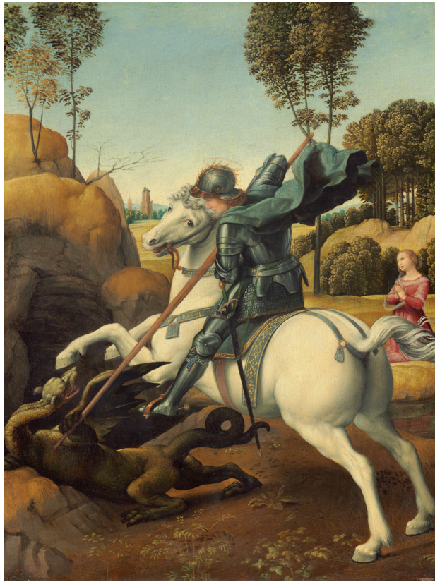
Raphael, Saint George and the Dragon , c. 1506, oil on panel, National Gallery of Art, Andrew W. Mellon Collection

This painting is about the size of a piece of notebook paper.