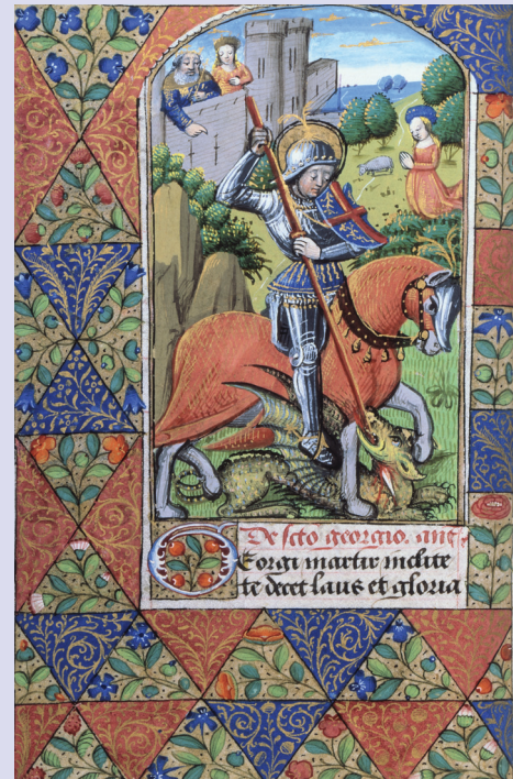
Suffrage to Saint George. Playfair Book of Hours. Ms.L.475 – 1918, fol. 174v. French (Rouen), late 15th c. Victoria and Albert Museum, London, Great Britain.

Create a story about your creature. Where did it come from? Where does it live and what does it eat? Who does it meet? Is it the hero or the villain of your story?