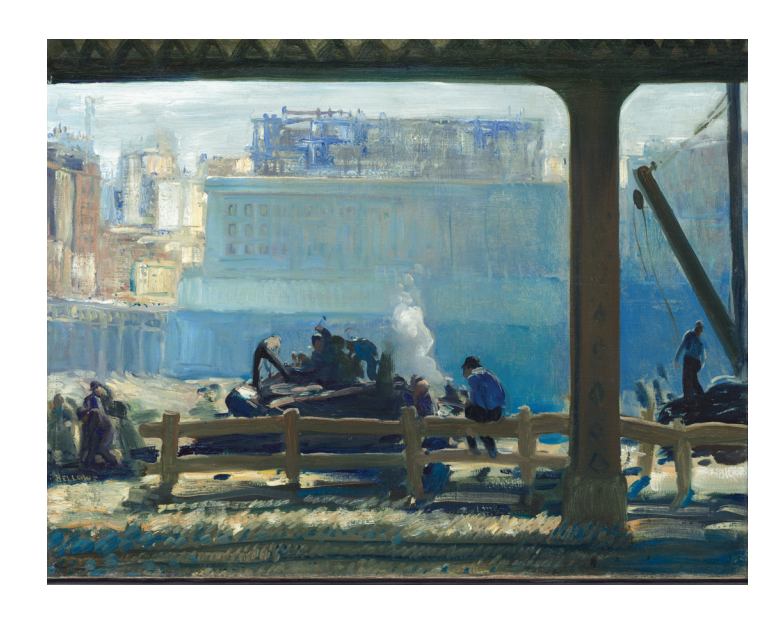
George Bellows, Blue Morning, 1909, oil on canvas, National Gallery of Art, Chester Dale Collection

Blue Morning shows the nearly completed station enveloped in morning haze. Construction workers are busy in the excavated pit; a crane arm rises. The elevated train tracks and a vertical girder frame the scene. Bellows used tones of blue, lavender, and yellow to create a sense of the morning light.