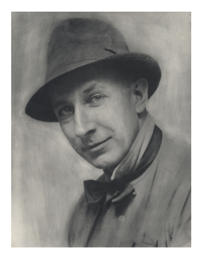
George Bellows, c. 1900