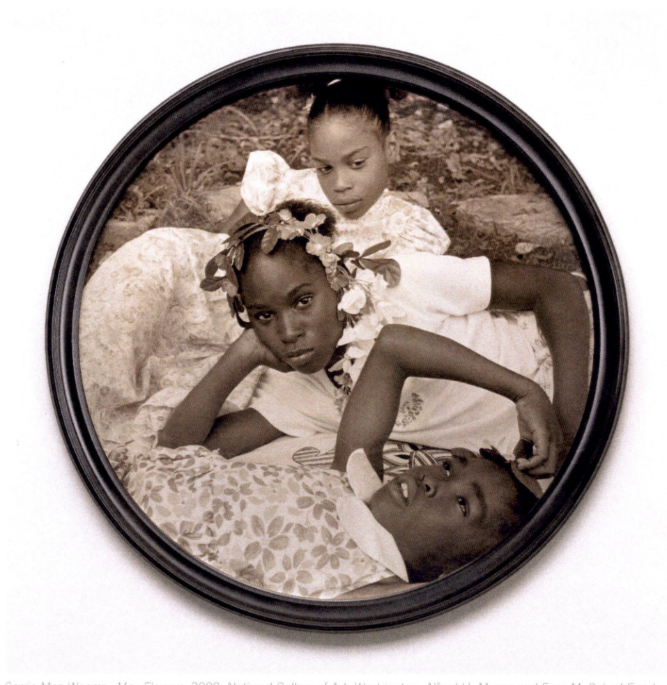
Carrie Mae Weems, May Flowers, 2002, National Gallery of Art, Washington, Alfred H. Moses and Fern M. Schad Fund.