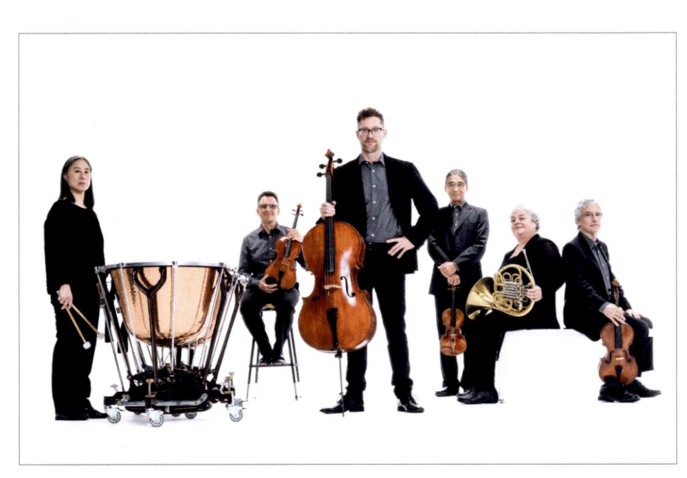
Orpheus Chamber Orchestra