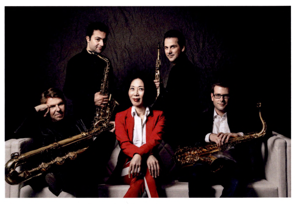
Alliage Quintett.