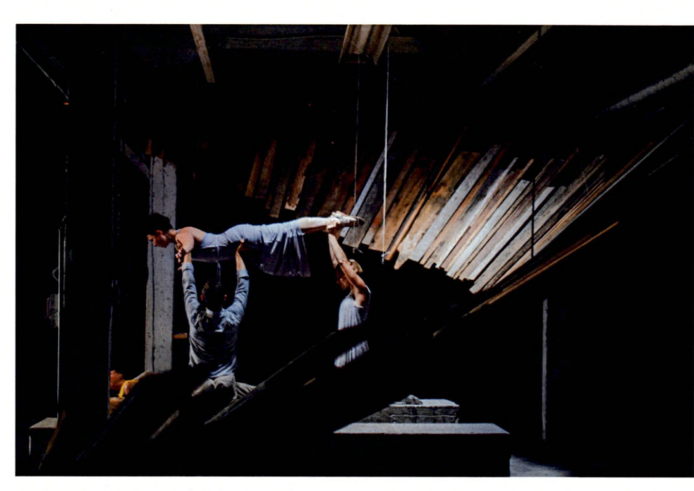
Euridice's death.