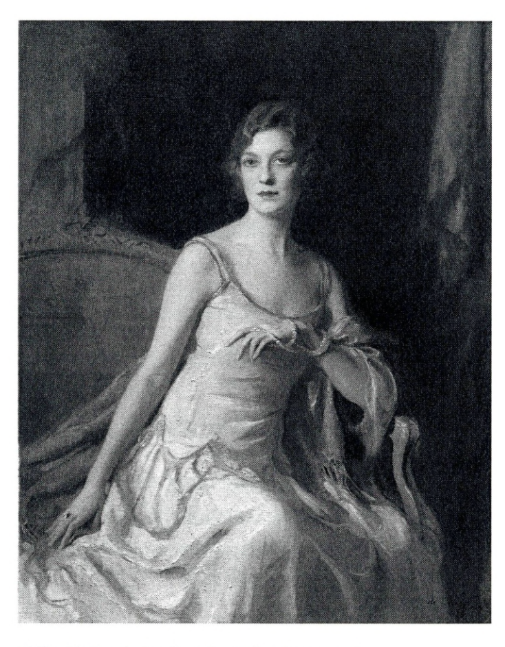
Philip Alexius de Laszlo, Ailsa Mellon Bruce , 1926, National Gallery of Art, Washington