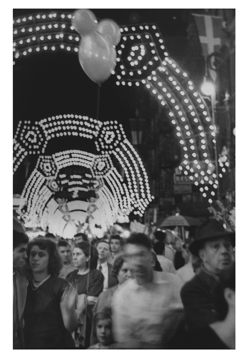
Sid Grossman, San Gennaro Festival, New York City, 1948, National Gallery of Art, Washington, Anonymous Gift