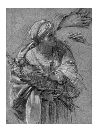
Simon Vouet, Creusa Carrying the Gods of Troy, National Gallery of Art, Washington, Ailsa Mellon Bruce Fund