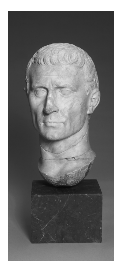
Portrait of Julius Caesar, possibly mid-1st century BC. Lent by the Toledo Museum of Art; Purchased with funds from the Libbey Endowment, gift of Edward Drummond Libbey