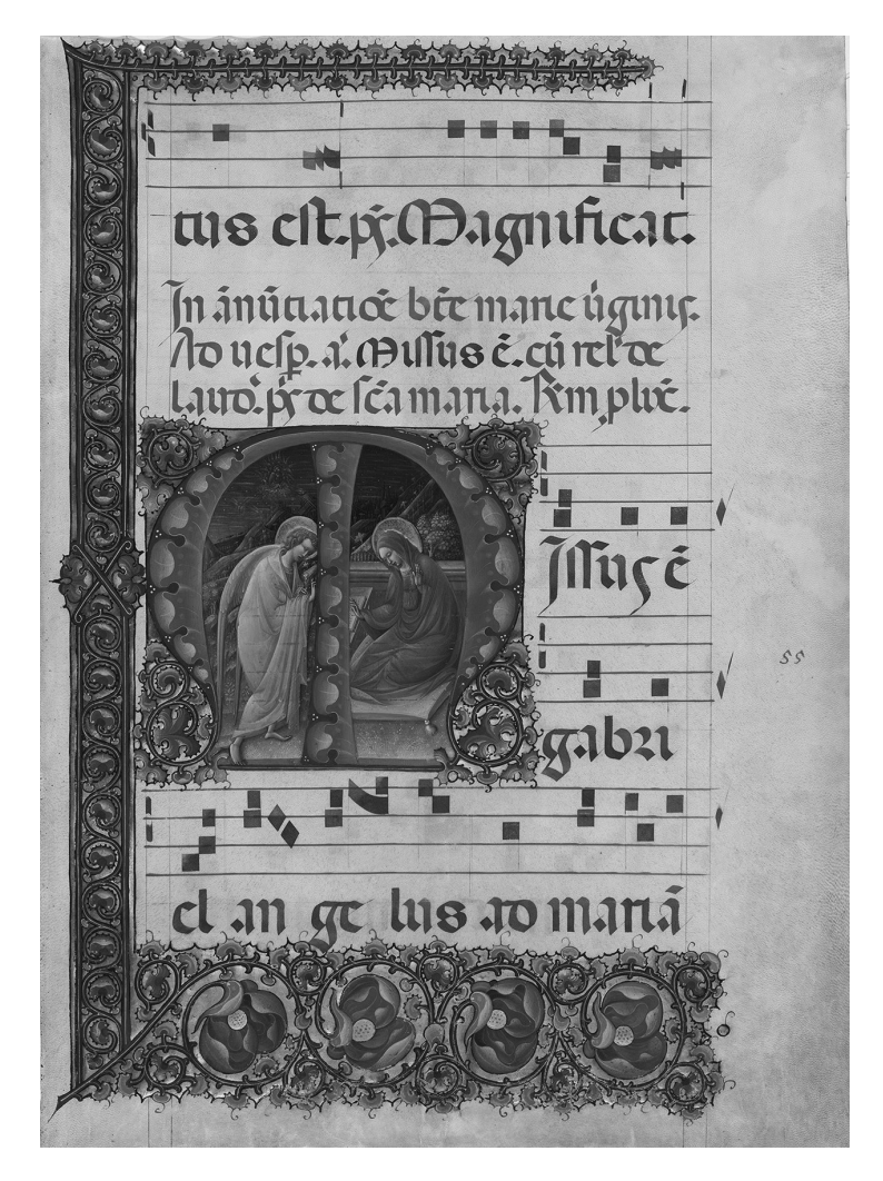
Belbello da Pavia, The Annunciation to the Virgin , 1450/1460. National Gallery of Art, Rosenwald Collection