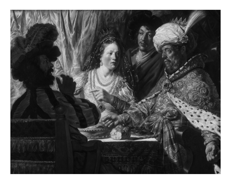
Jan Lievens, The Feast of Esther , c. 1625. North Carolina Museum of Art, Raleigh. Purchased with Funds from the State of North Carolina