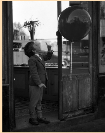
Film still from The Red Balloon , screening on October 4 and 5 as part of the children's film program Albert Lamorisse Classics