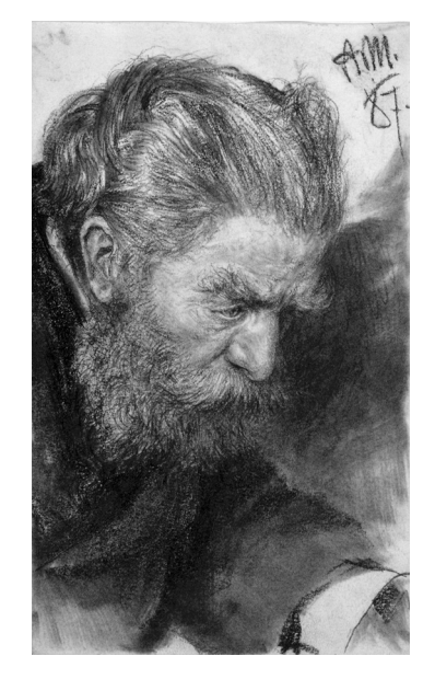
Adolph Menzel, Seated Man Leaning Forward , 1887. Private Collection