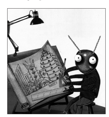
Film still from Roberto, the Insect Architect (July 7, 8, 11, 18), Little One: children's film program

The Children's Film Program is made possible by the generous support of washingtonpost.com.