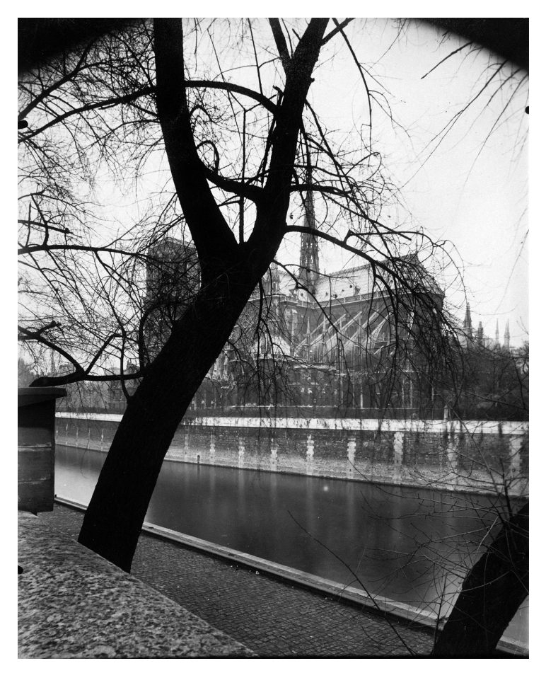
Eugène Atget, Notre-Dame , 1922. National Gallery of Art, Washington, Patrons' Permanent Fund