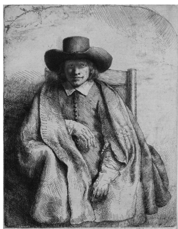
Rembrandt van Rijn, Clement de Jonghe (state one of six), 1651. National Gallery of Art, Washington, Rosenwald Collection, 1943

Learn more: www.nga.gov/exhibitions/parisinfo.htm