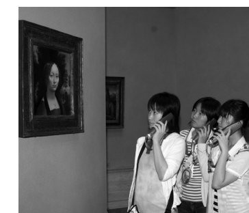
Visitors listen to commentary about Leonardo da Vinci's Ginevra de' Benci (c. 1474/1478). National Gallery of Art, Washington.

The adult program department of the division of education is recruiting enthusiastic, diverse, and service-oriented volunteer docents for its weekday, weekend, and foreign language programs to provide tours in English and other languages for adult visitors. Applications and related information are available on our Web site at www.nga.gov/education/volunteer.htm ; the closing date is March 23.