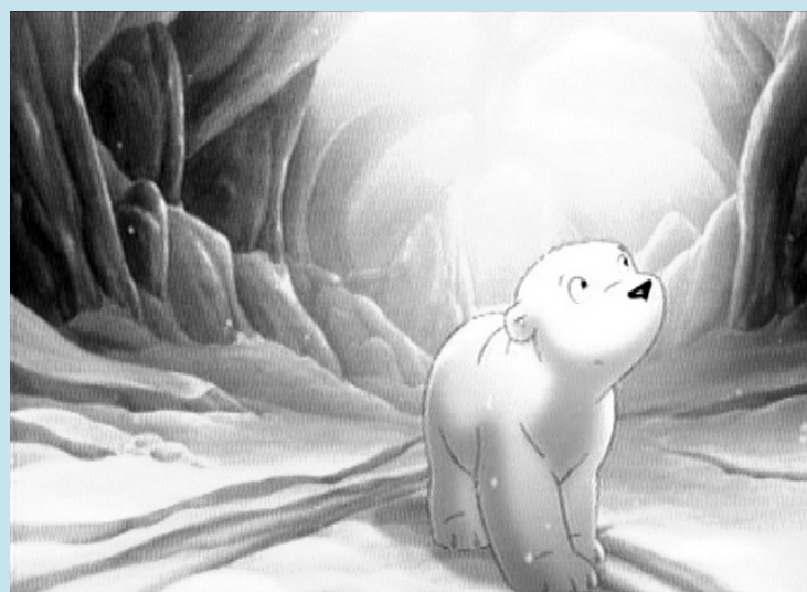
Film still from the children's film The Little Polar Bear: The Mysterious Island , screening on February 3 and 4