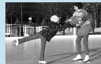
A mother and daughter enjoy a spin on the ice at the National Gallery of Art ice-skating rink.

Admission $7 (adults) $6 (children 12 and under, students with ID, seniors age 50 and over) $3 (skate rental) $195 (season pass)