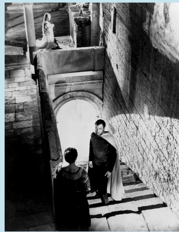
Film still from Othello with Orson Welles, screening on January 5 and 6.