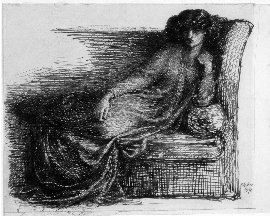
Dante Gabriel Rossetti, Jane Morris , 1870. National Gallery of Art, Wash- ington, Ailsa Mellon Bruce Fund