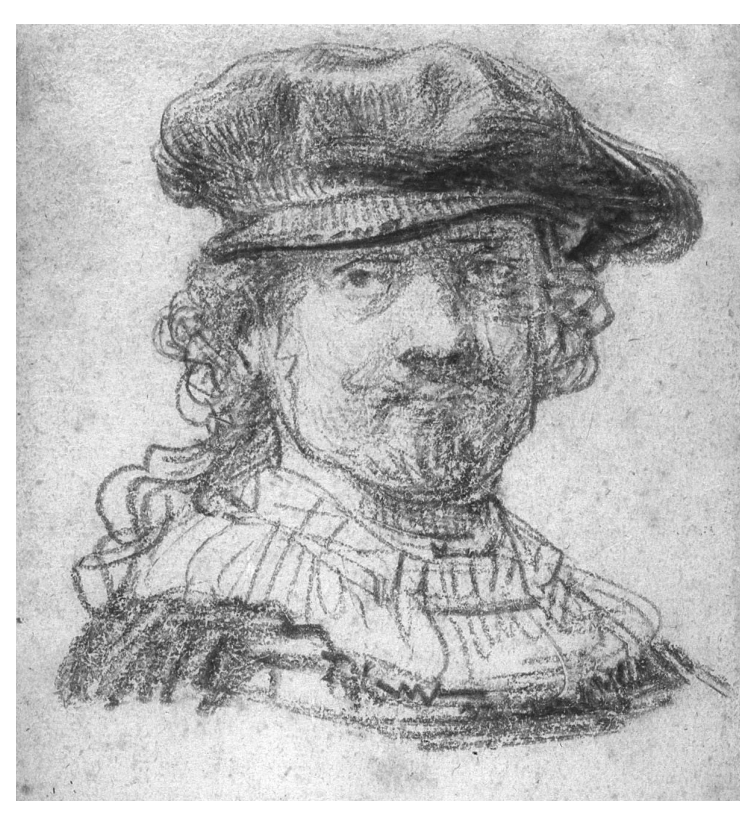
Rembrandt van Rijn, Self-Portrait , c. 1637. Rosenwald Collection, National Gallery of Art, Washington

Learn more: www.nga.gov/exhibitions/geniusinfo.htm