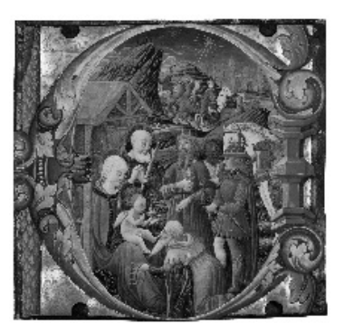
Franco dei Russi, Initial E: The Adora tion of the Magi, probably Ferrara or Mantua, 1470s.

Learn more: www.nga.gov/ exhibitions/miniatureinfo.htm