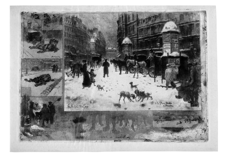
Félix-Hilaire Buhot, Winter in Paris ( Paris in the Snow ), 1879. National Gallery of Art, Washington, Helena Gunnarsson Buhot Collection

Learn more: www.nga.gov/ exhibitions/homerinfo.htm